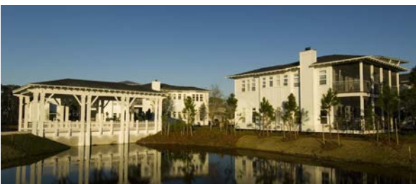
Miramar Beach, Florida

Type 3 - Update of Reserve Study without Site Visit - An annual update to the reserve study is simply good planning. This allows you to "refresh" the funding plan and account for minor variations from the original funding plan. We inquire about expenditures made, changes in pricing of replacement costs, and variations in funding from the original plan, but do not perform a site visit. This is a valuable planning tool at a very reasonable cost, generally no more than 25% of the cost of a full study.